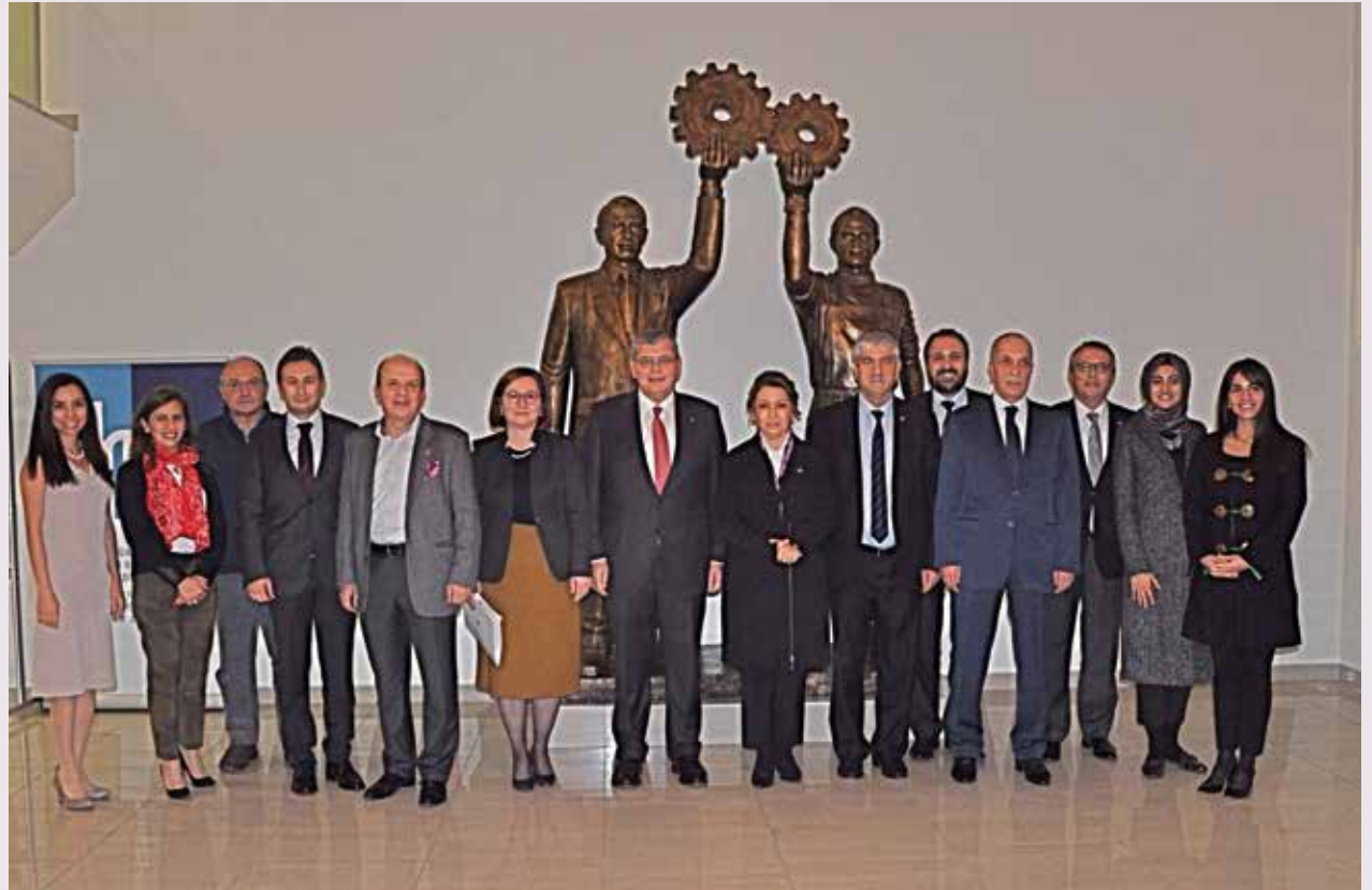
TISK 2015 CSR Awards Nomination Committee

The grand award was granted to Ford Otosan's "Disabled Friendly Plant" project.