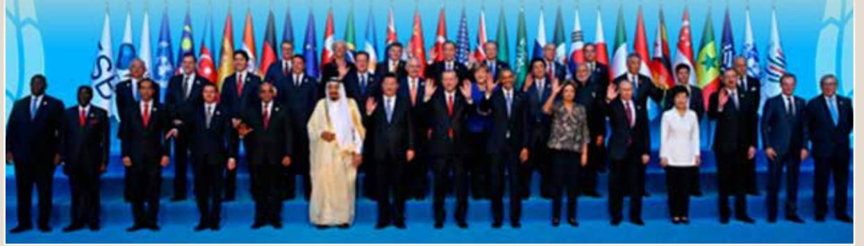
G20 Leaders' family photograph in Antalya

G20 Summit of heads of state or government was held in Antalya on 15-16 November 2015 following the B20 Summit gathering business leaders which was held on 14 November.